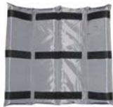
Cylinder Divider Cylinder Pillow